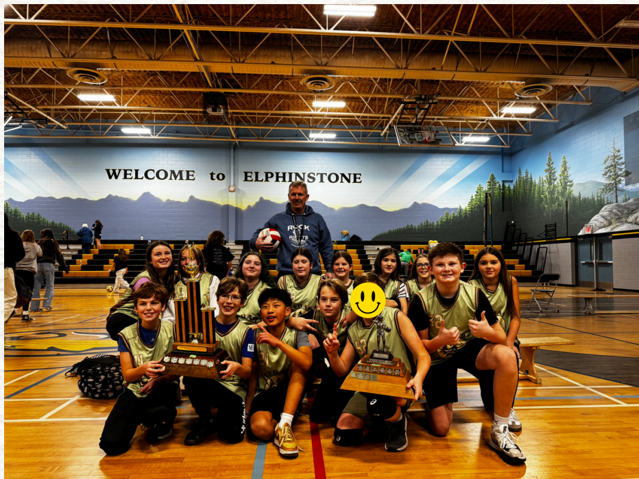
Grade 6/7 at Elphinstone for the district meet!