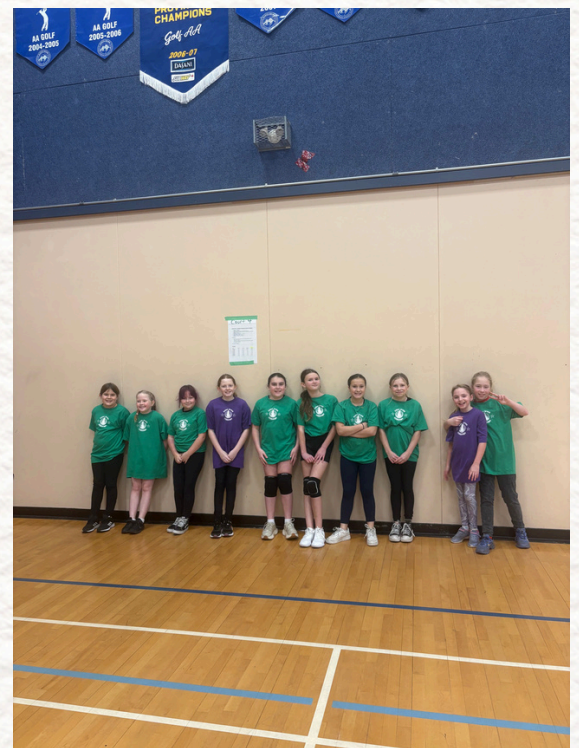
Grade 4/5 volleyball team at Chatelech for the district meet!