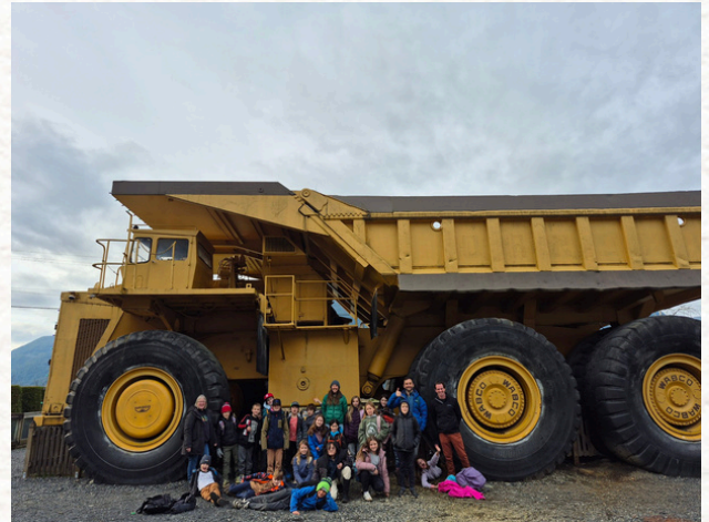
Div. 4 visited the Brittania mine, thanks Dan Tsuji for driving the mini bus!