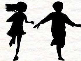
Cedar Grove representing at the district meet!